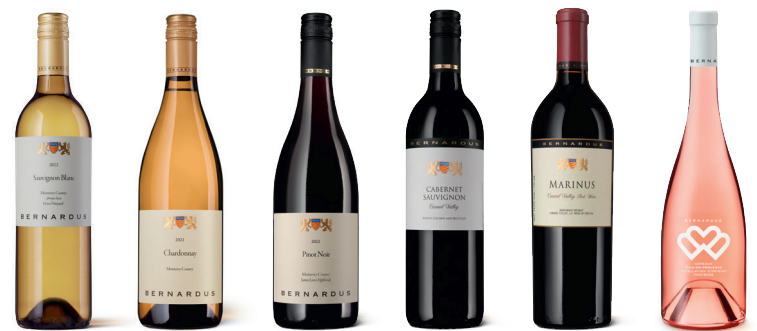
Sauvignon | Chardonnay | Pinot Noir | Cabernet Sauvignon | Marinus | Provence Rosé